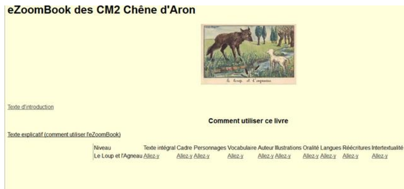
Figure 1. Table of Content of the Fable eZB

work. When assembling the production, the different layers were defined, and arranged so that they presented themselves as tabs that also served as a table of contents.